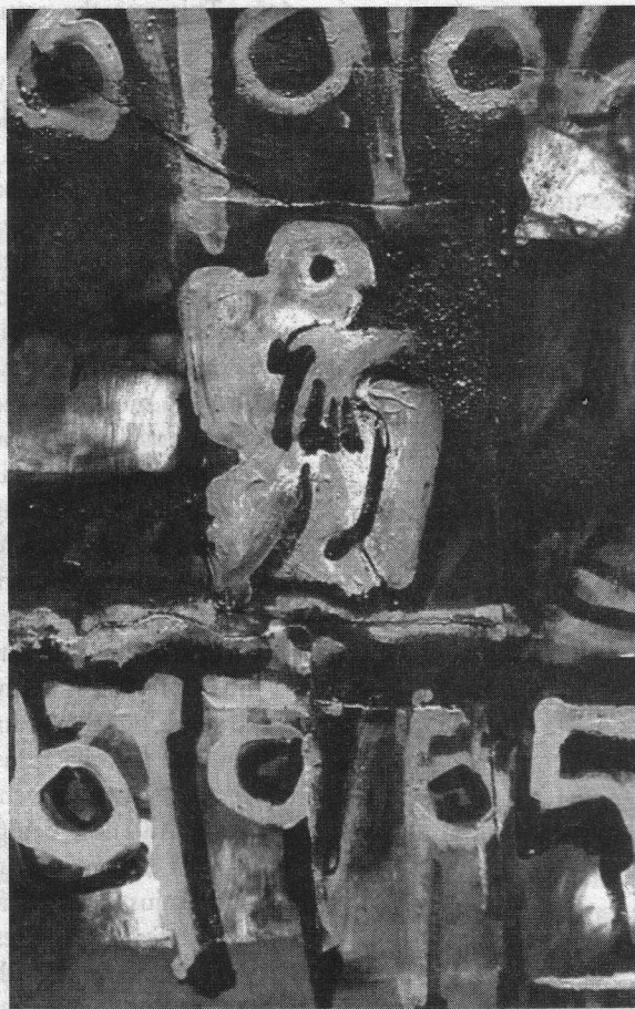
Fear , by Jan Eldridge

Meditation center policies do have honorable motives. Retreats often involve great psychological and physical stress and can stir up powerful emotions. Sitting for hours, living in silence, and breaking familiar routines of food, sleep, and work can be overwhelming. From time to time a retreat participant will go into an emotional crisis or need additional attention